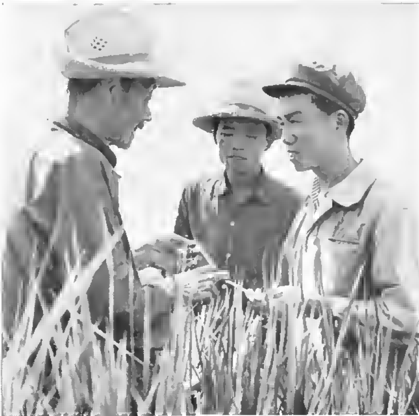
A Kunshan Chemical Fertilizer Plant worker (right) discusses the effectiveness of his plant's fertilizer with two local peasants.

In Kiangsu province, 37 small rural plants went into production in the past decade. The Wuchin Chemical Fertilizer Plant, with a capacity of 3,000 tons of synthetic ammonia per year, was begun in